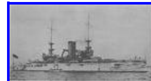
The USS Illinois